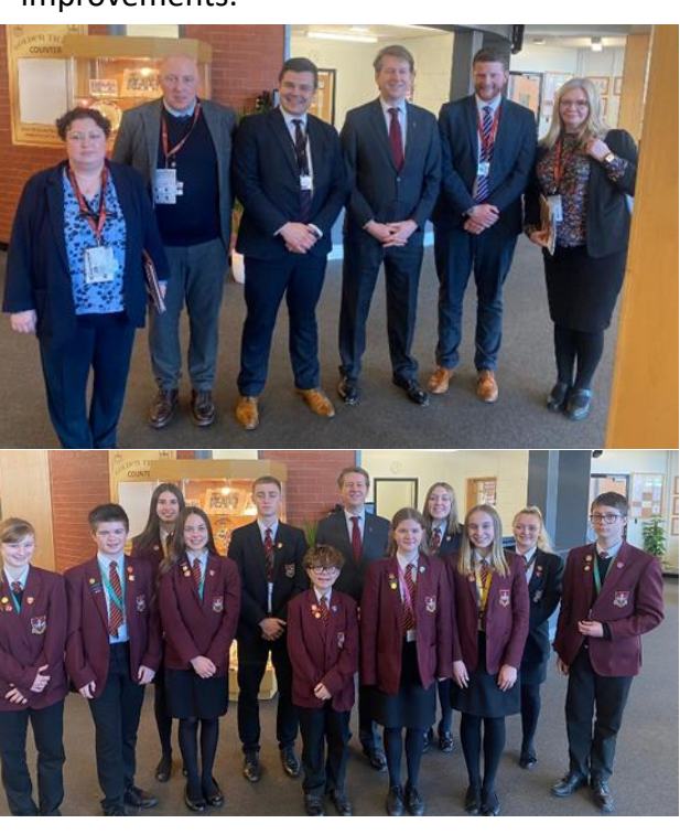
As always, thank you for your on going support.

To be selected by the local authority and to then impress the Minister of State for School Standards on a tour around the academy is a fantastic achievement and something staff and students should be very proud of. This is another indicator that the academy is making significant improvements.