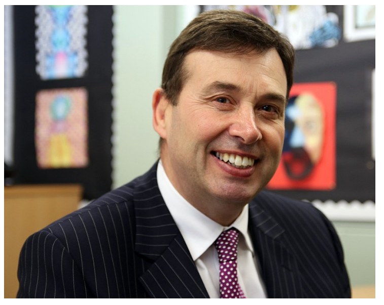
and provide our students with a broad range of experiences, beyond those that are experienced directly in school.

In March, Year 11 Dance students gave an excellent recital evening, in preparation for their external assessment. This was an opportunity to perform in front of an audience, and hone final improvements, ahead of their examination performance. Everyone was left wondering how they had managed to memorise the moves of multiple dances. 'Science Week' has been celebrated in school and a special evening was put on for parents of Year 8 students, the 'Next Three Years Evening', to advise on Key Stage 4 subjects – GCSEs and applied subjects – that these students will embark on in Year 9. Our current Year 9 students visited the Beth Shalom Holocaust Centre earlier this half term, while all Year 12 students enjoyed a week of Work Experience. These type of activities help to enrich our curriculum