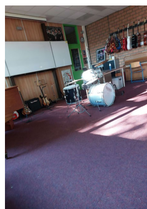
Left: the view from Thijs's cycle to school; middle: a Dutch school corridor; right: a Dutch music room